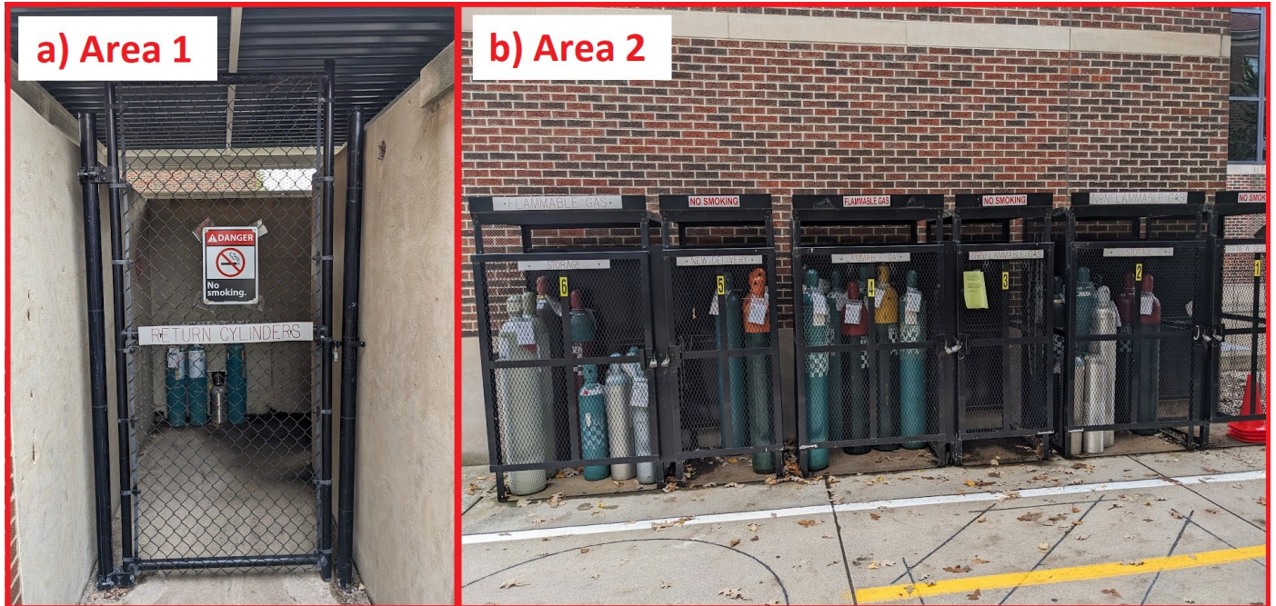
Figure 1. (a) Area 1 - Return cages by PHYS. (b) Area 2 - New arrivals by FRNY.